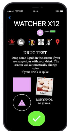
Fig. 2, drug test screen

This is for anyone who goes to the clubs, bars, and parties. Everyone should always watch their drink. There is always a lurking predator that will put a drug in your drug, making you unstable. They will do unspeakable things to you once the drug makes an effect. Thus, the screen of the iWatch is designed to detect any substances in your drink. If the screen does not change colors, it means that it is safe to drink. If the screen changes color, it means your drink is spiked. Look at the application in your phone as it will indicate what kind of date-rape drug that is being use in your drink as shown in figure 2. It will also show what the effect of the drug and what to do if you happen to drink it.