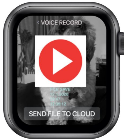
Fig. 3 iWatch screen for recorder

iWatch screen, as shown in figure 3, it reveals how long the recording is, when it is recorded and where it is recorded. If you think the file is necessary, you have the option to send the file to the cloud, and you can access it in the Watcher App.